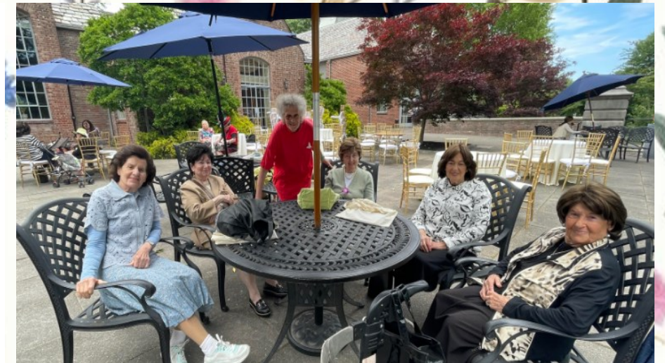
A few Nissim Ladies enjoying the beautiful day at COJO's Garden Party